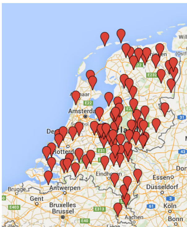
Fig 1. The geographic location of the pastures where the Acer seeds, sprouts and leaves were sampled.

After an information campaign in horse journals and at meetings, 278 samples of maple tree leaves, sprouts, and seeds collected by horse owners in 2014 were sent to Utrecht University (UU) and RIKILT-Wageningen UR (Figs 1, 2, 3). The samples were taken from the ground, packed in plastic, and immediately sent to the laboratory where they were stored at -20^{\circ}\text{C} within 24 hours of collection. They were classified by an experienced botanist at the species level ( Acer pseudoplatanus , Acer platanoides , or Acer campestre ) on the basis of the samples and accompanying photographs sent by