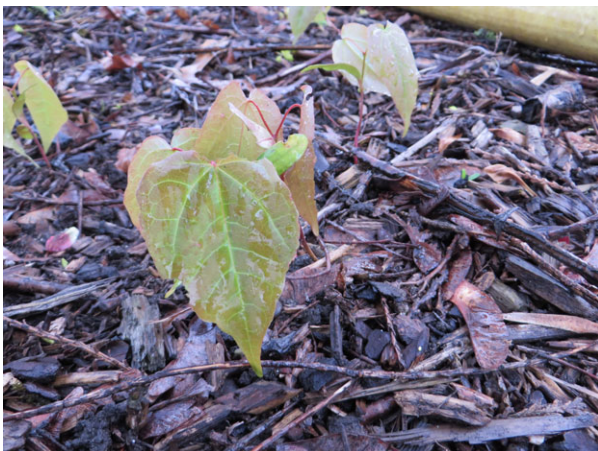
Fig 3. Acer sprouts.

Control for normal distribution was performed. A P value of .05 was set as statistically significant.